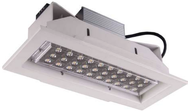
30 Watt High Powered Recessed LED Light